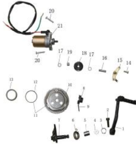
图6 起动装置 FIG.6 STARTER COMP