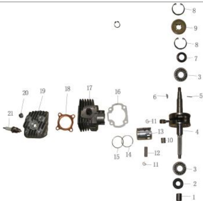
图1 气缸、曲轴连杆机构 FIG.1 CYLINDER、CRANKSHAFT COMP.